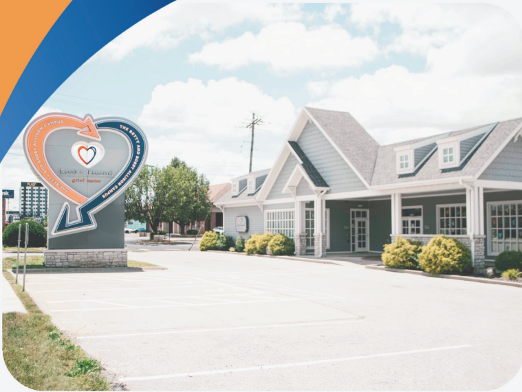
Lost & Found Grief Center is located at 1555 S. Glenstone in Springfield.